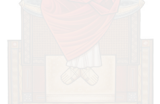
(Note: This is Part 1 in a 7 part series on Carrying the Cross. The series continues on each Sunday of the Holy Great Fast and concludes on Lazarus' Saturday.)